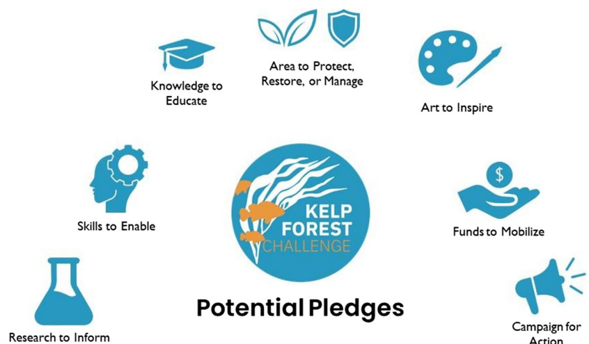
Fig. 3 Different types of pledges that may be submitted to the Kelp Forest Challenge

Because the level of protection afforded by marine protected areas can vary, entries to the site, area, and habitat protection category are also graded based on its protection status. These levels of protection are established by the IUCN Protected Area Management Categories (Dudley and Stolton 2008) and range from full protection (level I) to different levels of partial protection (level II-VI). If a conservation