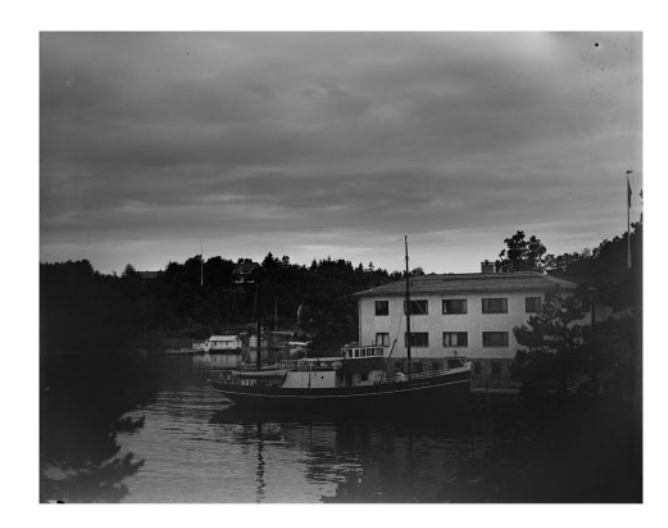
Figure 3. R/V Johan Hjort (2). Johan Hjort (2) was launched in 1931 with the aim to support the fisheries in a period of economic depression. The small ship operated mainly in coastal waters but was the first Norwegian vessel equipped with an echo-sounder (Schwach, 2004; Havforskningsinstituttet, 2008). Technical specifications: Shipyard: Gravdal Skipsbyggeri, Norway; built, 1932; length, 80 ft (25 m.); beam (not known); grt., 67 brt; main machinery, 90–120 hp (66–88 kw).

fluctuations in fish catches (Schwach, 1998, 2014). Hjort championed the establishment of ICES as a scientific and fisheries expert community (Schwach, 2002). He chose the