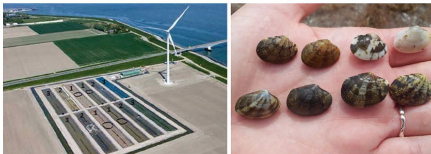
Fig. 11.2 Left: Four cascading-pond systems each consisting of three interlinked ponds in The Netherlands. The system is designed for cultivation of the common sole ( Solea solea ), the king ragworm ( Alitta virens ) (pond 1) and the Manila clam ( Venerupis philippinarum ) (pond 3) by reusing fish waste streams to stimulate phytoplankton production (pond 2). Right: Manila clams cultured in the cascading-pond system

Milhazes-Cunha and Otero (2017) reviewed the biomitigation potential of integrated fish-phytoplankton-bivalve systems indicating that nutrient removal efficiencies are generally high (>90%) for recirculating aquaculture systems. This is higher compared to cascading-pond systems which have lower removal efficiencies (67% ammonia, 47% phosphate) (Hussenot et al. 1998). Shpigel et al. (1993) demonstrated that for a pond system gilthead seabream ( Sparus aurata ) and the Japanese