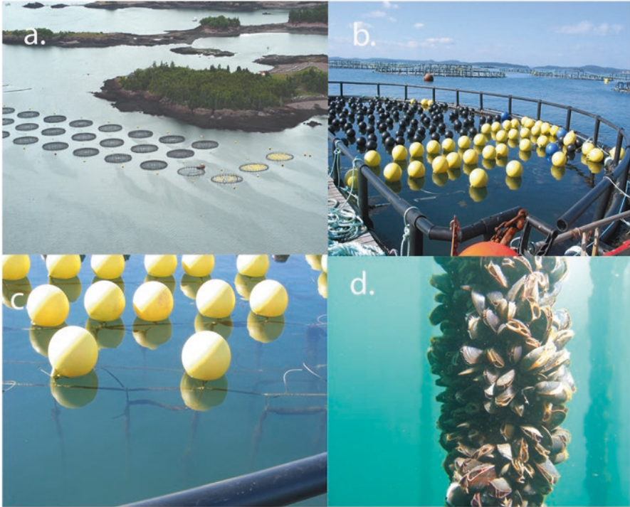
Fig. 11.1 Farming mussels in association with salmon farms in the Bay of Fundy, (a) aerial shot of a salmon farm in the Bay of Fundy with 4 rafts of mussels on the down-stream end, (b) a mussel raft showing the arrangement of mussel lines hanging within an empty fish cage collar and the suspension system using floats, (c) close-up of the mussel lines showing the mussel socks hanging down from the top line that is supported by the buoys, (d) close-up of one of the mussel socks hanging from the top line on one of the rafts.

With experience gained from testing the IMTA concept in varying environments, the approaches and understanding of IMTA principles are continually evolving and have broadened (Chopin 2013; Jansen et al. 2015; Fang et al. 2016). The use of bivalves in IMTA development might be characterized as being in its infancy, as bivalves are being studied for their ability to directly capture of organic particulates from farm sites and also in the larger scale of relative nutrient extraction at the bay level without specific requirements on proximity to a farm and nutritional connectivity (Chopin 2013). Other potential benefits provided by bivalves in IMTA are improved perception of sustainable production by the public (Yip et al. 2017), extraction of pathogens and salmon lice from finfish aquaculture (Molloy et al. 2011, 2014; Bartsch et al. 2013; Webb et al. 2013), their role in the carbon cycle with consequences for CO 2 sequestering and climate change (Jiang et al. 2015; see also Filgueira et al. 2019) and new socio-economic approaches to motivate industry to adopt IMTA (Shi et al. 2013; Hughes and Black 2016).