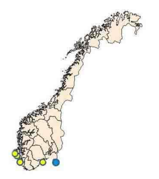
Figure 1. Yellow circles indicate the sampling sites for flat oysters ( Ostrea edulis ) and mussels ( Mytilus sp.). The blue circle indicates the sampling site at Ytre Hvaler, where mussels were collected in October.