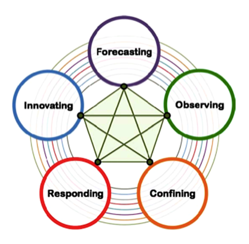
Figure 1. Schematic of grand challenges from the "Earth System Science for Global Sustainability".