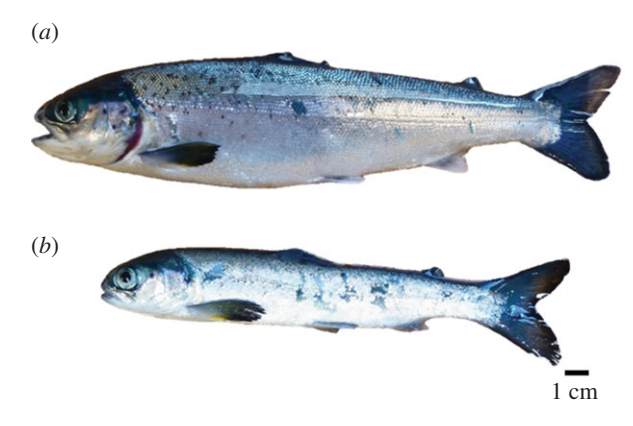
Figure 1. Representative pictures of healthy ( a ) and GS ( b ) fish from and aquaculture farm in the Langenuen Straight, Western Norway.

Table 1. Average length and weight ( \pm s.d.) and number ( n ) of healthy and GS Atlantic salmon collected during first (S1) and second (S2) samplings at basal and acute stress conditions.