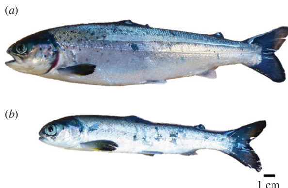
Figure 1. Representative pictures of healthy (a) and GS (b) fish from an aquaculture farm in the Langenuen Strait, Western Norway.