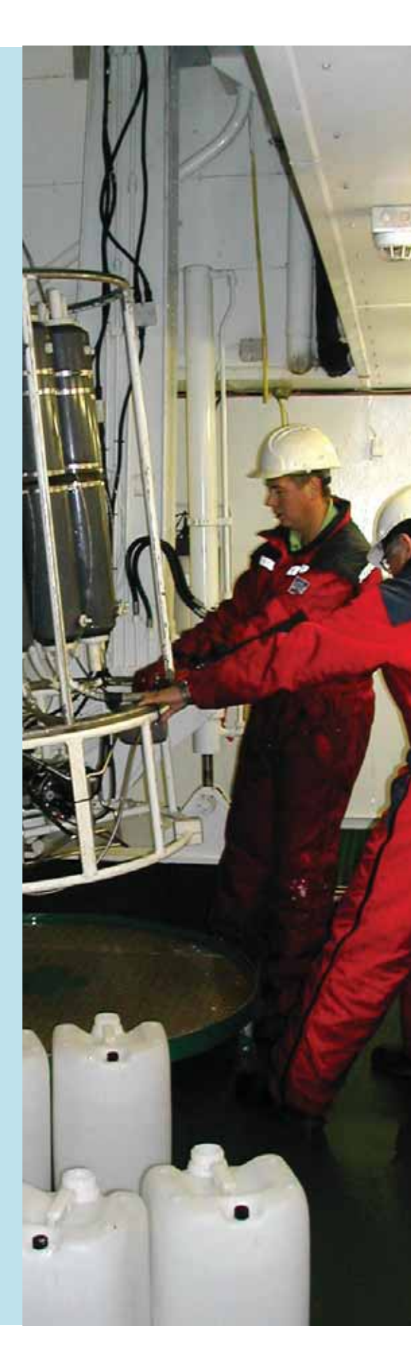
Figure 2: From the early beginning oceanographic sampling has been part of the capelin surveys.