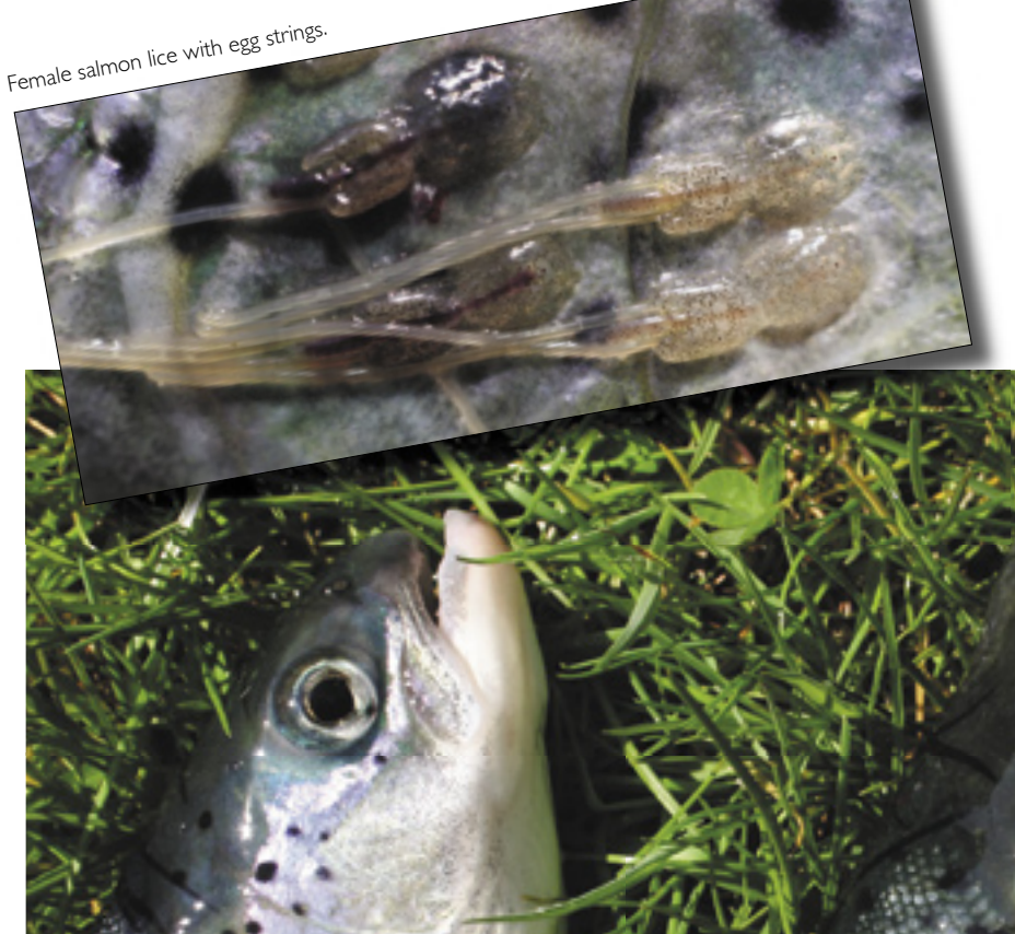
A clear difference in infection level: but does this reflect resistance?

The estimation of heritability, loosely defined as the degree of genetic control over a trait, is the first step in a breeding programme. Experiments at IMR have demonstrated that a genetic component in susceptibility to lice exists in salmon (Figure 1). In theory, this should allow us to select salmon that suffer