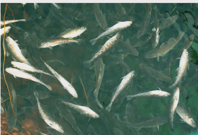
Fig. 2. Gadus morhua . Atlantic cod showing clinical signs of viral encephalopathy and retinopathy (VER). Infected fish show abnormal swimming behaviour, with looping and lack of coordination.

( vibrio ) anguillarum by the rapid agglutination test Mono-Va (Bionor).