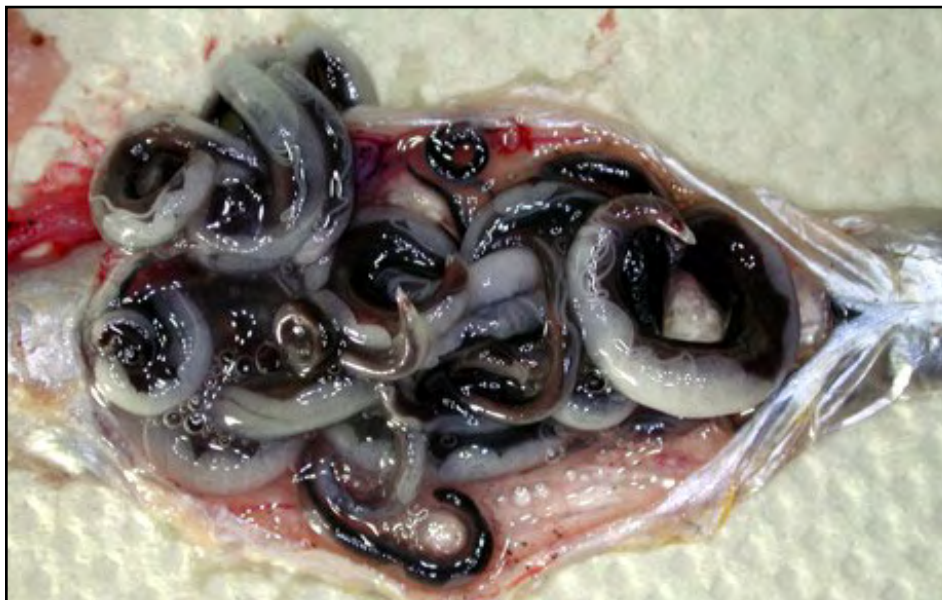
Figure 2.3.3.2.1. The introduced parasitic nematode Anguillicola crassus is found in the swim bladder of 80 to 100% of silver eels.