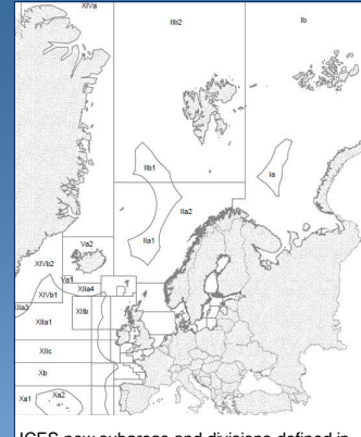
ICES new subareas and divisions defined in 2003 to deal with deepwater fisheries issues

The communication plan with stakeholders includes participation by DEEPFISHMAN partners in RAC meetings, collaboration with stakeholders at the Case Study level, a DEEPFISHMAN newsletter and two further workshops.