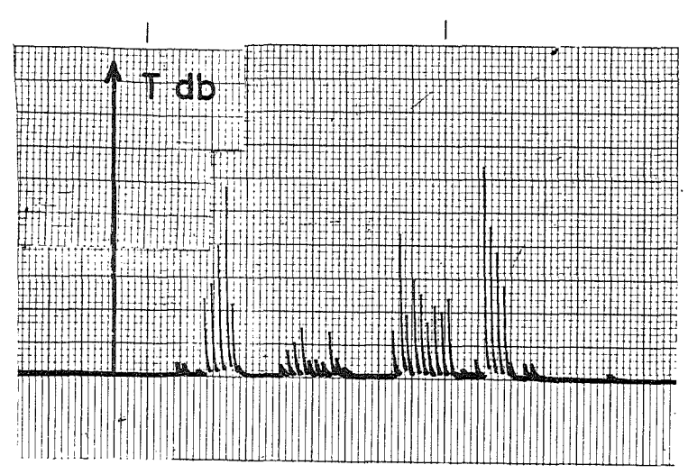
Fig. 2. Single fish traces from the integrator. "G. O. Sars", Malangen, February 1966.