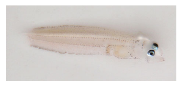
Fig. 2. Hippoglossus hippoglossus larva, 15 mm standard length, from Fauskevika, Skjerstadfjorden, North Norway.

All four halibut larvae were of similar developmental stage, and the standard length of one larva was estimated to 15 mm. All of the halibut larvae had food in their guts and had reached a developmental stage that corresponded to approximately two weeks after the establishment of exogenous feeding (Pittman et al., 1987). The larvae were sparsely pigmented and had melanophores between the myomeres. In addition, dorso- and ventrolateral rows, and dorsal and ventral contour rows of melanophores were observed at the edge of the primordial fin, including a preanal ventral abdominal contour row of tiny melanophores. Two distinct areas of melanophores were observed above the brain (occipital and neck), and two other pigmented areas were seen at the angle of the lower jaw and in the heart region (Figure 2). The caudal tip of the notochord was just barely bent upwards. The observed larvae corresponded to the 13.5 mm Atlantic halibut larva first drawn by Schmidt (1904), and which was referred to as postlarva. Further, the collected halibut larvae from Skjerstadfjorden also matched stage 3 larvae as given by Thompson & Van Cleve (1936) for the closely related