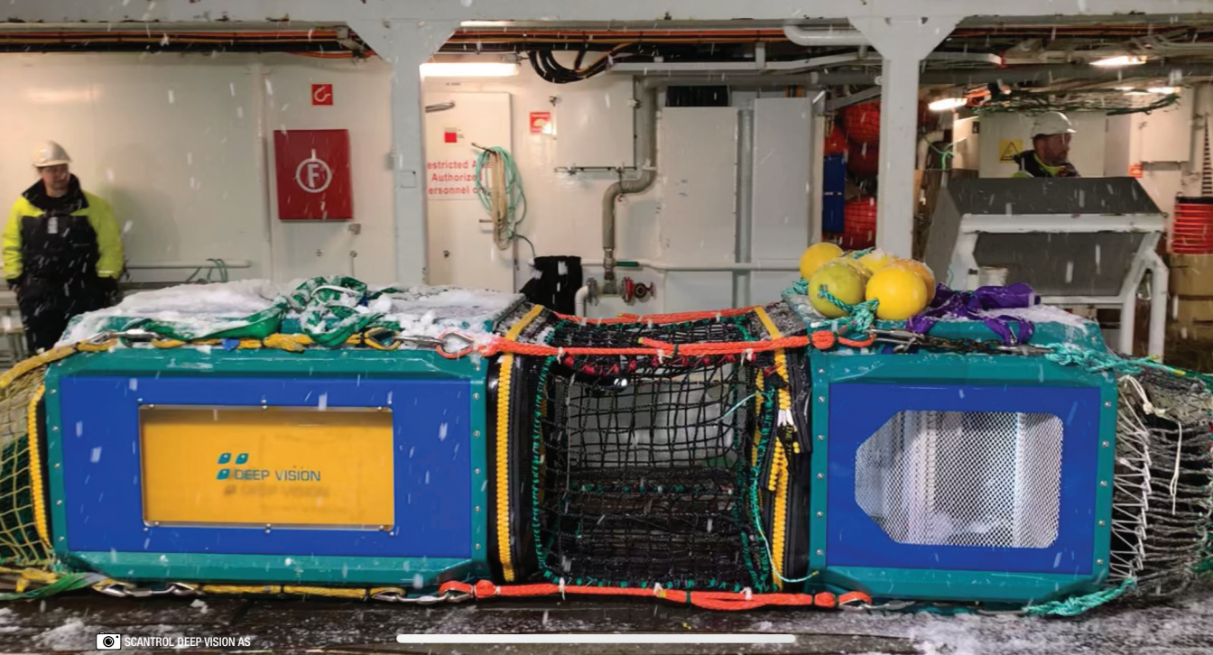
Figure 3: The Scantrol Deep Vision system with the prototype selection device mounted after the imaging unit.

to a wider range of fishing companies and marine science institutions, and we can obtain a lot more data across a range of fisheries and ecosystems.