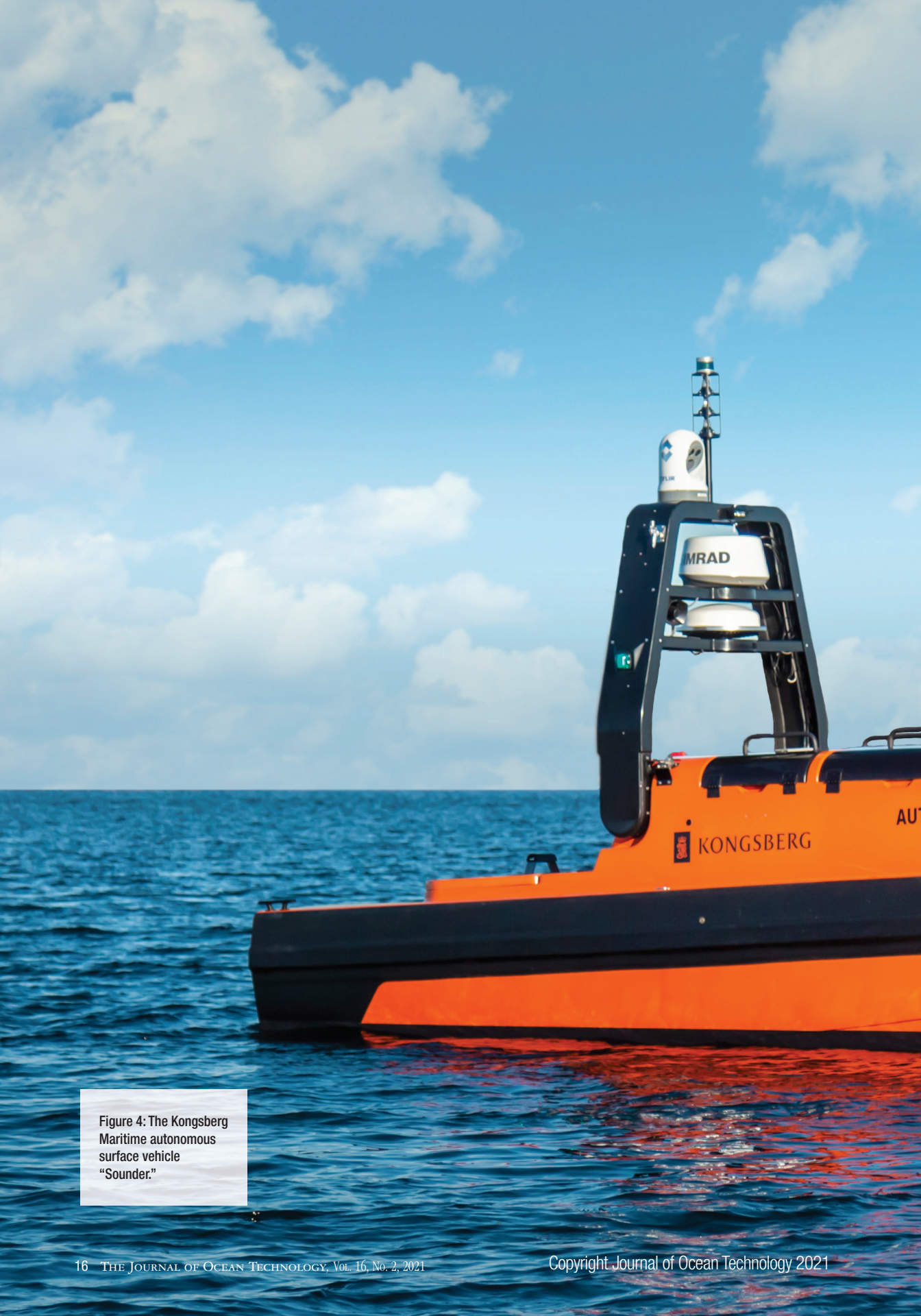
Figure 4: The Kongsberg Maritime autonomous surface vehicle "Sounder."