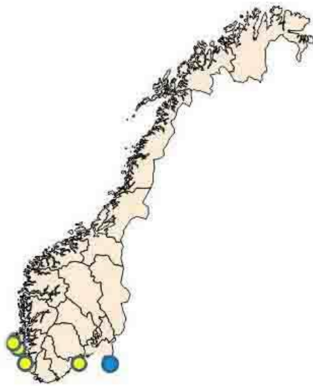
Figure 1. Yellow circles indicate the sampling sites for flat oysters ( Ostrea edulis ) and mussels ( Mytilus sp.). The blue circle indicates the sampling site at Ytre Hvaler, where mussels were collected in October.