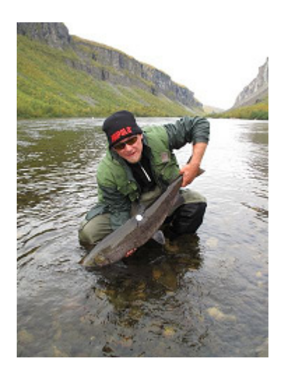
Figure 2: If the fish has to be taken out of the water, hold it horizontally with a combination of gentle grip around the base of the tail and support under the front part of the belly. The fish on the picture has been tagged for a scientific study.