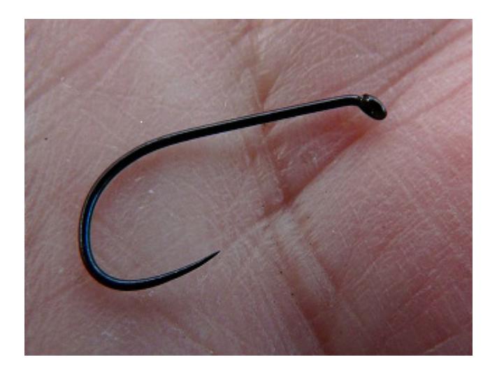
Figure 5: Barbless fly hook.