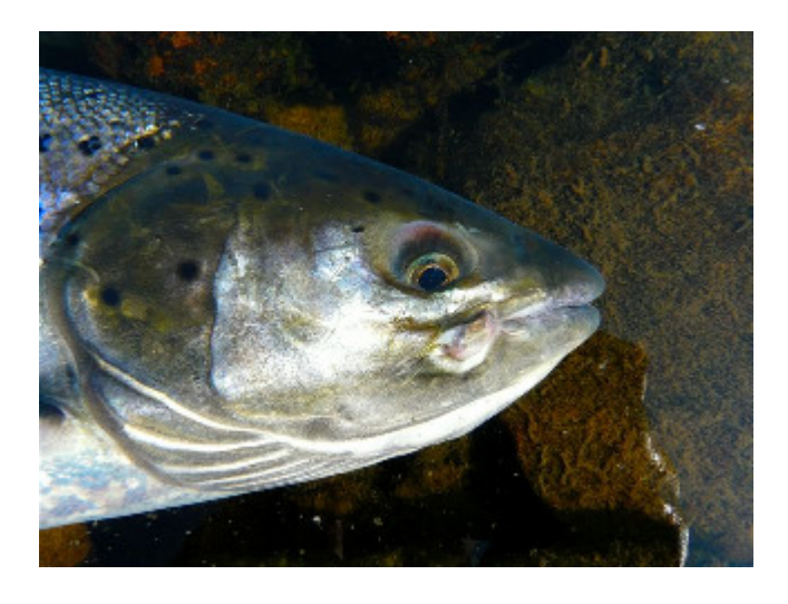
Figure 7: Atlantic salmon with damaged maxilla.

Physical damage to mouth parts occurs regularly where catch and release is practised. For example, Meka (2004) found that 30 % of the rainbow trout in the catch and release fishery on the Alagnak river (Alaska) had at least one scar consistent with hooking. The most common type of damage was tearing, dislocation or complete loss of the maxilla, the external part of the upper jaw (Figure 7). Damage to both the jaws and the eyes occurred in 10 % of the fish sampled.