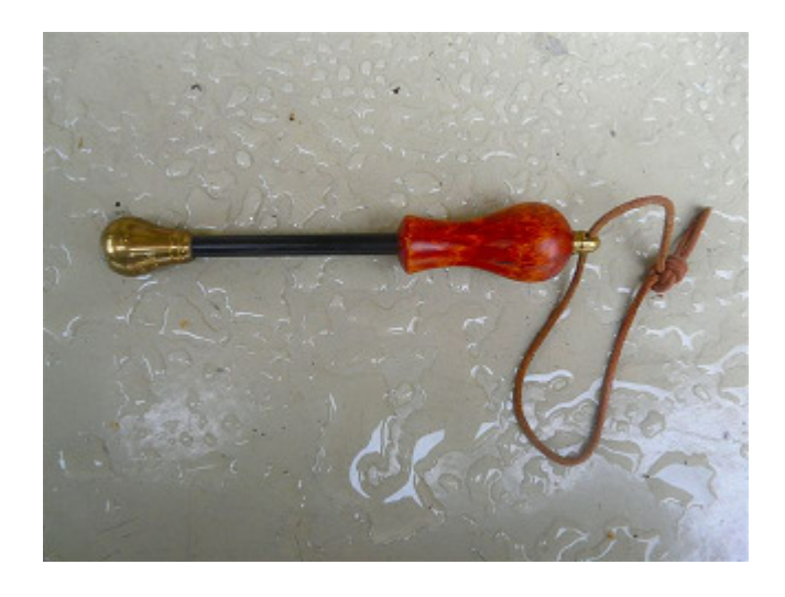
Figure 3: Priest.