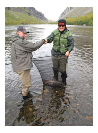
Figure 1: A gillie can be of great help during catch and release.

Under ideal conditions Atlantic salmon and other salmonids can probably cope with the effects of exhaustive angling. It is very difficult to establish the effects of playing time by anglers per se in isolation from other potential stressors (e.g. associated handling). Consequently, there is comparatively little data and information on the specific impact(s) of the duration and intensity of playing time on fish welfare and subsequent survival. Nevertheless, there is some circumstantial evidence that physiological disturbance is related to playing times and that fish that are retrieved quickly resume normal behaviors more quickly following release. As a general advice, anglers should a) reduce playing time to a minimum, and b) use equipment that facilitates rapid retrieval and capture (i.e. strong fishing line and a net).