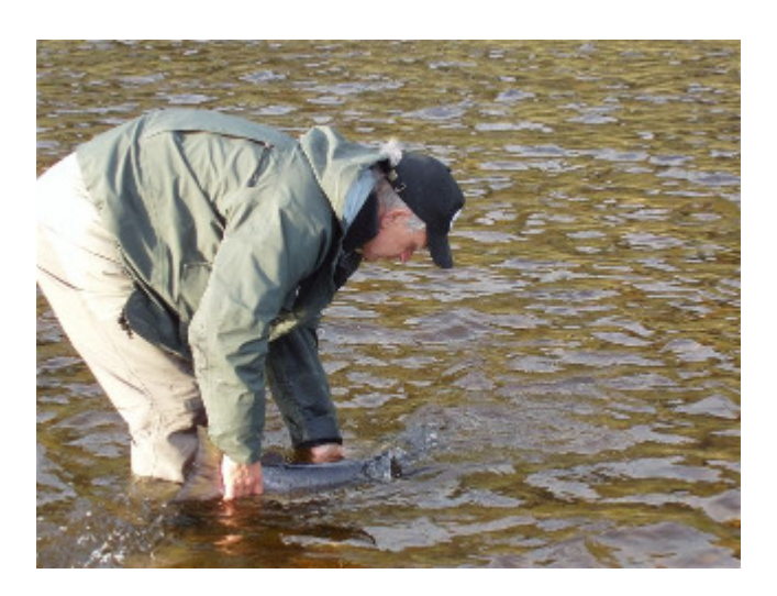
Figure 12: When the water temperature is below 17-18 °C and the fish is properly handled, the mortality of caught and released Atlantic salmon is low (0-6 %).

The consequences of injuries to fish, and the associated physiological or behavioural responses, depend on dose (degree of exposure) and tissue response, such as wounds and bleeding in relation to various environmental factors as water temperature, water chemistry and the presence of predators. Secondary infections may also be an important factor determining the final outcome of injuries. It is therefore very difficult to determine the minimum level of injuries or physiological or behavioural responses that will always be lethal to the fish as they will depend on other biotic and abiotic factors. However, serious and sustained bleeding from the gills or gill arches is an injury that in most cases will be fatal.