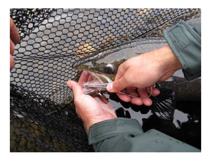
Figure 6: Most often the hook can be easily removed with long-nosed pliers.

Published studies generally show that there is an increased risk of deep hooking when using live bait compared to flies and spinning or wobbling lures. However, this may not only depend on the type of bait used, but also the angling techniques. There are no known studies on the effect of hooking location associated with worm fishing for salmonids in Norway. However, the general pattern gleaned from a number of studies of other species indicates that there may be a greater risk of deep hooking during worm fishing (i.e. natural baits) than when using flies and lures.