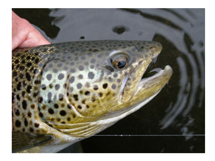
Figure 8: Brown trout with undamaged maxilla.

Reports of secondary infections associated with hook penetration related lesions in the mouth have not been found. Furthermore, the extent to which damage to the oral region including loss of the maxilla interferes with normal feeding behaviours and intake is not documented. Damage may also occur to the gills, particularly if the fish is deeply hooked. The gills should never be touched with hands as they are fragile structures that easily break, causing haemorrhage and increased susceptibility to fungal infection (Ferguson, 2006; Pickering and Richards, 1980).