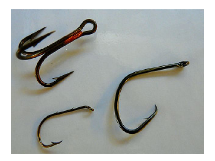
Figure 4: Treble, normal and circle hook.

trout, (DuBois and Kuklinski, 2004), rainbow trout (Mason and Hunt, 1967), largemouth bass Micropterus salmoides (Pelzmann, 1978). Hook size may also affect the frequency of deephooking. In several species of Mediterranean fish, it has been shown that fish taken with larger hooks were seldom deeply hooked (Alos et al., 2008). This may be explained by physical limitations for the fish to swallow larger objects, and the fact that large hooks are easier to remove than smaller ones. However, Thorstad et al. (2000) found no difference in the hooking site of different sized hooks (artificial flies) used to catch Atlantic salmon in the River Alta fisheries.