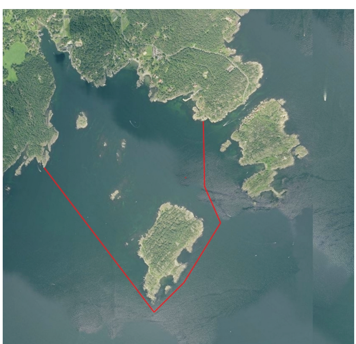
Flødevigen lobster reserve, Arendal Size: 1 km<sup>2</sup>

Contributions from stakeholders, such as local fishers, have been an important factor in the process towards establishment of the four lobster reserves. However, recognising and involving all stakeholders is a challenging task, especially the highly diverse and less organised group of recreational fishers. The research group is currently analysing how recreational fishers' can be involved in future MPA establishment processes. Involvement of all stakeholders, realistic expectations, timing and a suitable time schedule are considered among the most important aspects to secure a positive process.