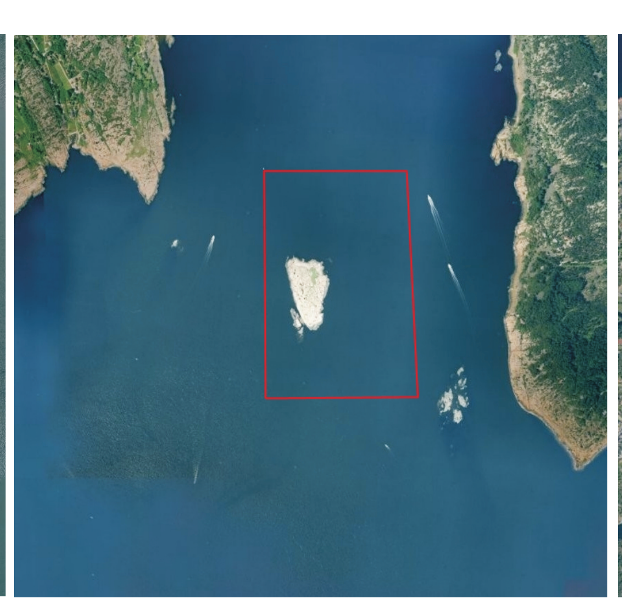
Kvernskjær lobster reserve, Hvaler Size: 0.5 km<sup>2</sup>