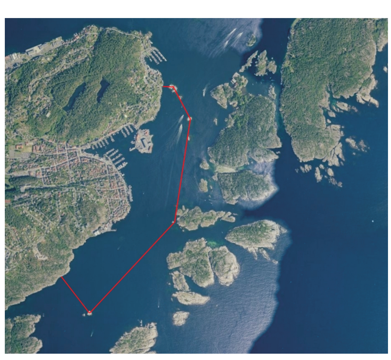
Risør harbour lobster reserve, Risør Size: 0.6 km<sup>2</sup>