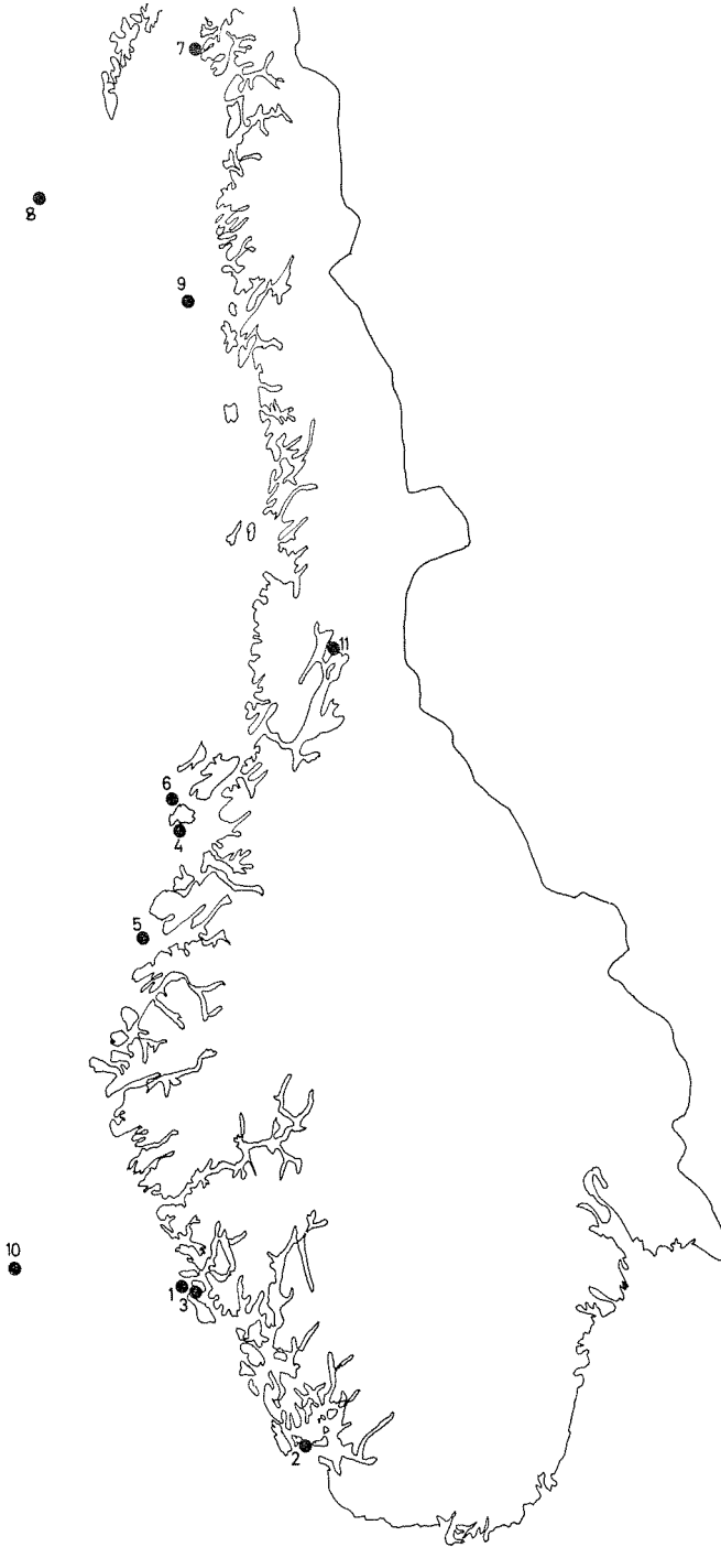
Fig. 1. The location of the Norwegian sampling stations listed in Table 1.