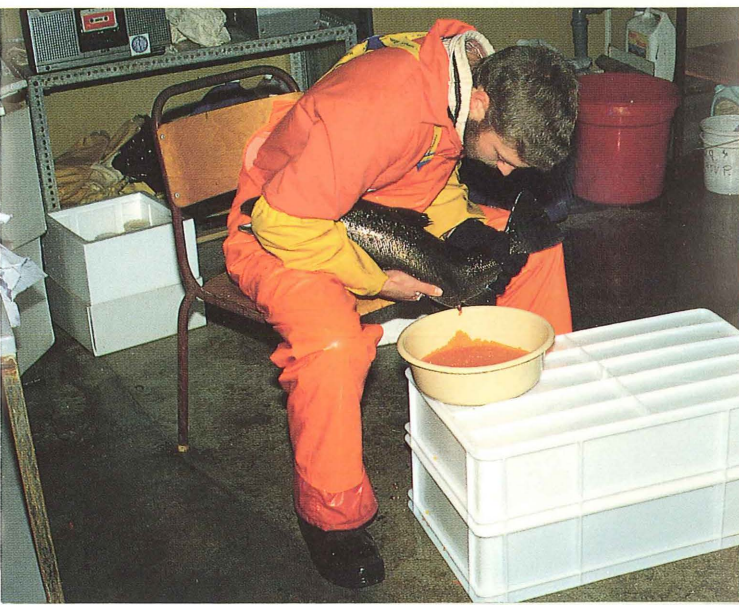
Stripping of female brood fish

The station's hatchery has a capacity for 2.4–3 million salmonid eggs, while fry and older fish can be maintained in the approximately 200 fibreglass tanks and the floating cages of various shapes and sizes. At the disposition of the station are a lab for water and general food analyses, a small feed kitchen, a freezer and cooler room, a classroom for up to 60 people and facilities including sleeping rooms and kitchen.