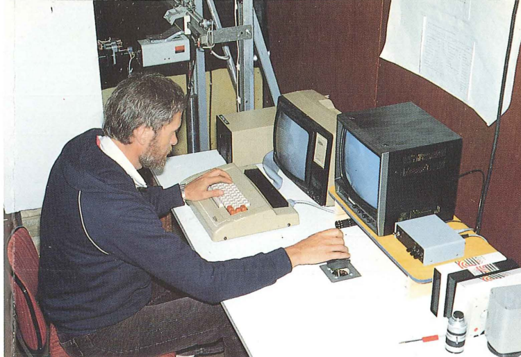
Recording of fish larvae behavior