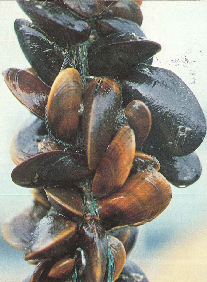
Reared blue mussels