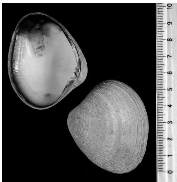
Fig. 2. Ruditapes philippinarum . Manila clam from Seløy, Norway, with characteristic brown ring symptoms showing recovery (shell repair stage = 2.5) on the inner shell surface. Scale bar is in cm

10^6 CFU ml -1 . In one clam, a similar abundance of bacteria to the extrapallial fluid was found in the mantle ( 3 \times 10^4 CFU g -1 ). After using selective methods, i.e. growth on thiosulfate citrate bile sucrose (TCBS) agar, mannitol, temperature of 30°C, agglutination tests and species-specific primed (SSP)-PCR identification, only 1 strain fulfilled the criteria defined for Vibrio tapetis . This strain was isolated from a plating of extrapallial fluid from 1 clam collected in May 2003 showing signs of shell repair (SRS = 2.5). According to colony morphology on marine agar (MA) and MA supplemented